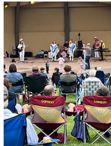
RosePointe residents watched a ABBA tribute band at Central Park last month.